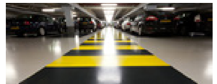
Car Park Systems